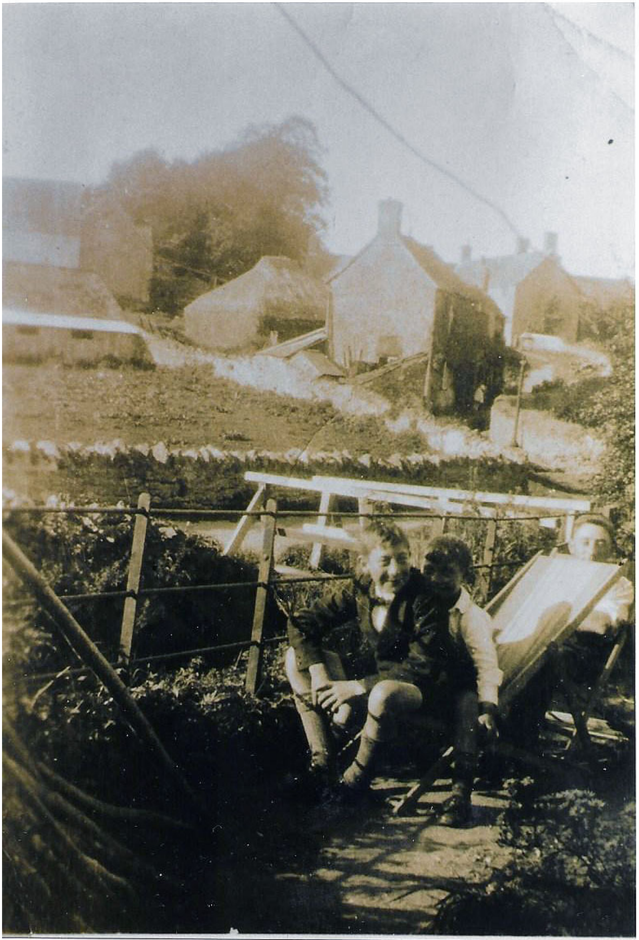
Photo 15 View Across the Brook